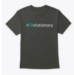
rEvolutionary Classic Tee