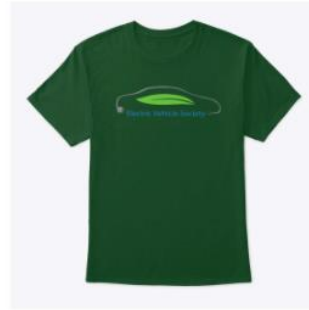
EV Society Classic Tee