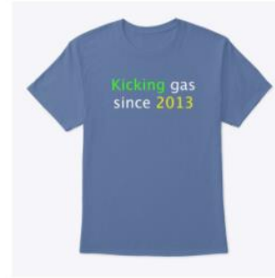
Kicking Gas Since 2013