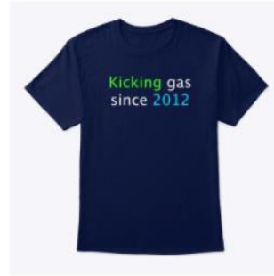
Kicking gas 2012 Tee