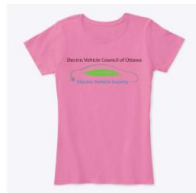
EVCO Women's Comfort Tee Women's Comfort Tee $18.45 CAD