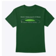
EVCO Men's Classic Tee Classic Tee $16.86 CAD