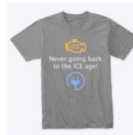
ICE Age Triblend Tee $22.85 CAD