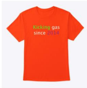
Kicking Gas Since 2014