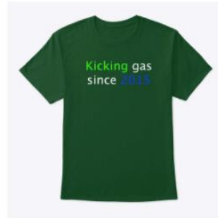
Kicking Gas Since 2015