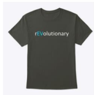
rEvolutionary Classic Tee Classic Tee $15.89 CAD