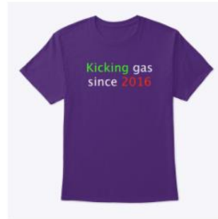
Kicking Gas Since 2016