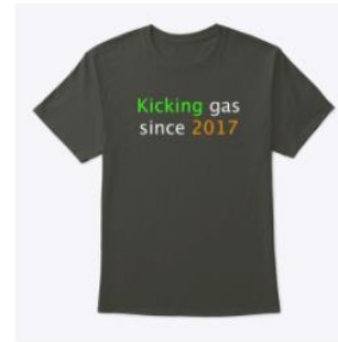
Kicking Gas Since 2017